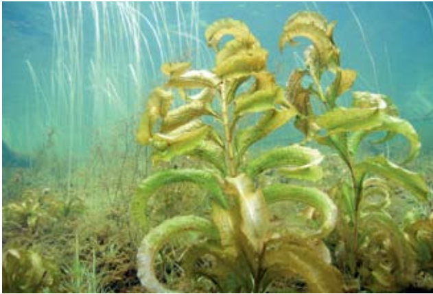
The leaves of large-leaf pondweed are gracefully arched and translucent

Look Alikes: May be confused with other species of the Potamogeton genus, including curly-leaf pondweed.