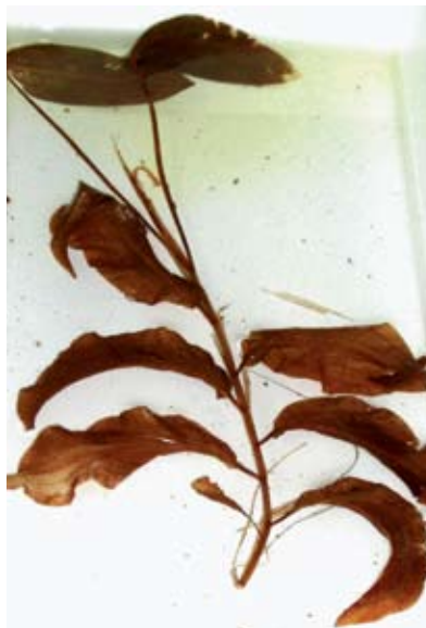
Large-leaf pondweed has folded submersed leaves, flat oval-shaped floating leaves and large pointed stipules