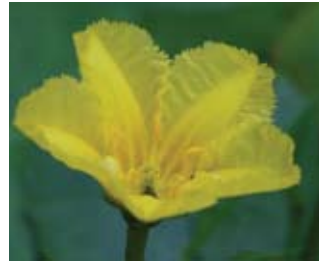
Yellow flower has five delicately fringed petals