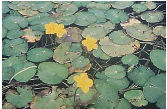
Yellow floating heart